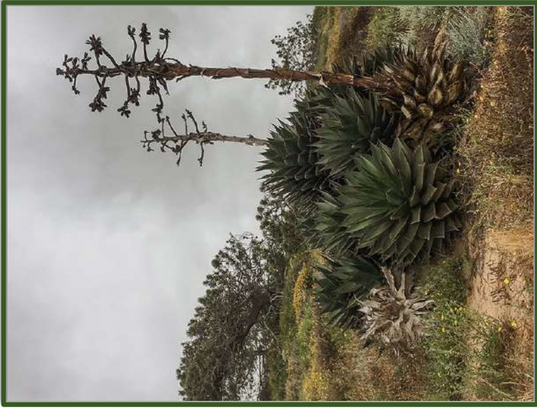
Agave shawii, Coastal Agave, in Torrey State Nature Reserve Pines CA, is Globally imperiled. Only 2 known populations - 60 genetic individuals - remain in the wild in CA ( http://explorer.natureserve.org )