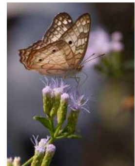
White Peacock ( Anartia jatrophae )

Sierra Club video about the wall. https://www.youtube.com/watch?v=7vlx0h8njok&feature=youtu.be