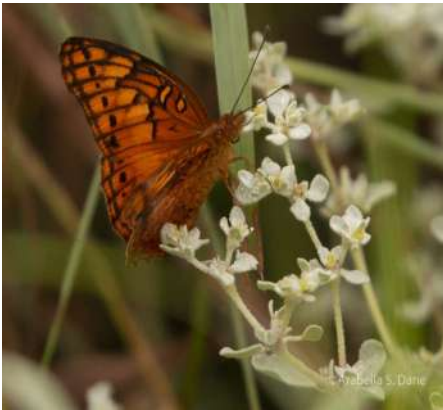
Mexican Fritillary ( Euptoieta hegesia )