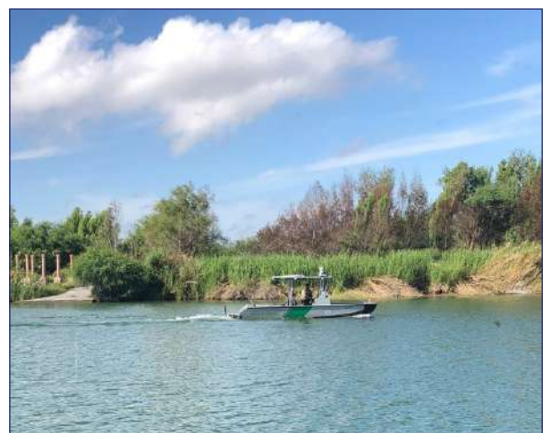
Photo from the dock where we boarded our tour boat looking across the river to the Mexican side as a gunboat patrol went by.