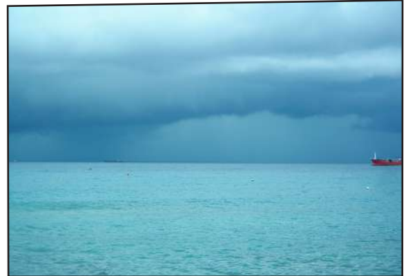
Storm coming inland from the ocean.

OK, but my well water is still within the good range for salts... what is the big issue? The issue is that your well is pulling water from the same aquifer that is being used to provide drinking water to your home. Of course, the water going to your home is filtered and cleaned before going to your home. Water for our businesses, homes and landscapes in south Florida is coming from the Biscayne aquifer and the Floridan aquifer.