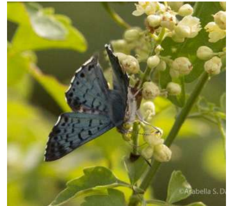
Blue Metalmark ( Lasaia sula )

The Lower Rio Grande is the major stopping point for the seasonally migrating birds on their way to and from Mexico, Central, and South America. Much work has been done to enhance the habitat in the Lower Rio Grande for this vital stopping point for these migratory land and aquatic migrants. While we were chasing “our” butterflies, the birders in our group were thrilled to see a Roadside Hawk, the Varied Thrush, several unusual flycatchers, and a pair of Altamira Orioles.