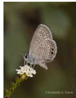
Ceraunus Blue ( Hemiargus ceraunus )