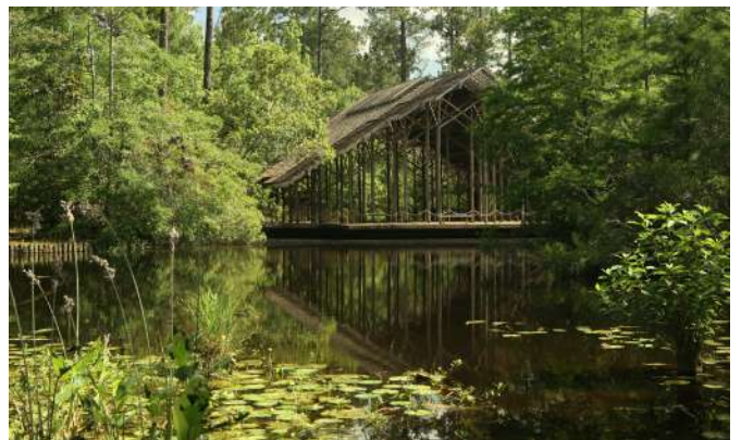
Crosby Arboretum Tour - Pinécote Pavilion