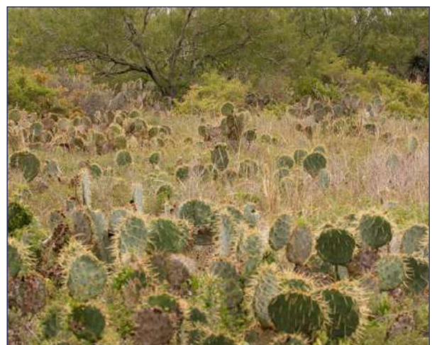
Upland habitat in the Boca Chica area.

During the three days of the Butterfly Festival, our van load of 8 butterfly enthusiasts and the other vans of similar size saw at least 153 different butterfly species while tramping through several of the many varied habitats that exist along the lower Rio Grande. The sites we visited included an urban location in Roma, an excursion into the Yturrita thickets, and a walk through the very saline, marshy area in Boca Chica where the river meets the sea.