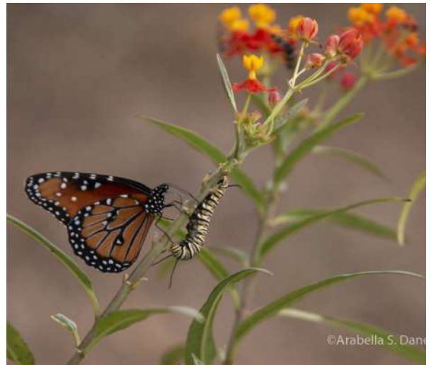
Queen butterfly with Monarch caterpillar.

My concern is that the current plan for building the wall is not going to solve the immigration problem and will do irreparable damage to the communities and the ecosystems in its path. Among the wildlife-critical areas, sensitive natural areas, and private conservation areas along the Lower Rio Grande threatened by this construction, the major part (70 of 100 acres) of the National Butterfly Center will be in its path. The 70-acre piece being taken from the NBC by the border wall is primarily scrub-land habitat populated with pollinator-friendly plants. The following link lists most of the Lower Rio Grande's rare and endangered species , many of which grow on the NBC grounds. On pages 24-25 of the list, you will find the at-risk plants of the Lower Rio Grande. This list includes the Federally Endangered plants, the G1-G2 plants (globally at risk), as well as those that are on the Texas state list as being rare and endangered.